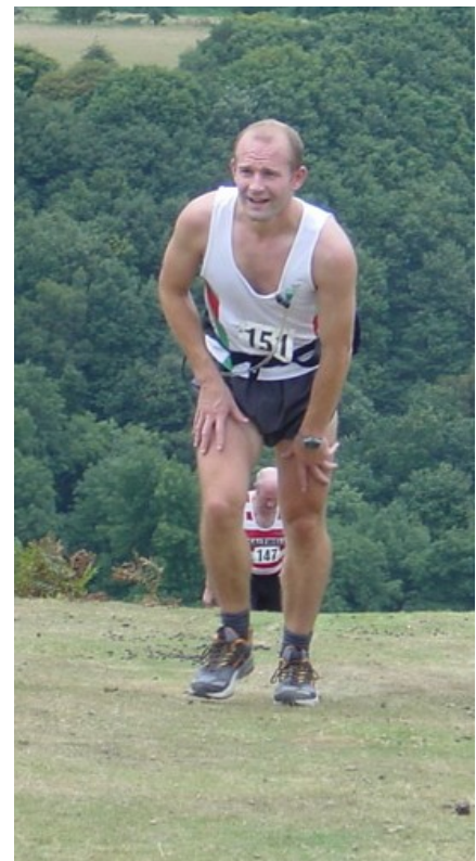
Photo: The editor struggling up Ragleth at the Stretton Skyline in September.